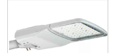
PHILIPS LUMISTREET GEN 2 BGP 292

LEGEND PUBLIC ROAD LEGEND PHILIPS LUMISTREET BGP292 DM50 9xLM LED-HB 5.25 730, MOUNTING HEIGHT ON 10 MTR COLUMN NOTE: REFER TO 'PHILIPS' LIGHTING SPEC FOR FURTHER DETAILS. RAL COLOR OF EXTERNAL LIGHTING T.B.A WITH ENGINEER. EXACT LOCATIONS OF EXTERNAL LIGHTING T.B.C. ON SITE. ALL LIGHTING COLUMNS TO BE LOCATED MINIMUM 750 FROM KERB. Isolines 2.5 lx 5.0 lx 10.0 lx 15.0 lx 20.0 lx 25.0 lx