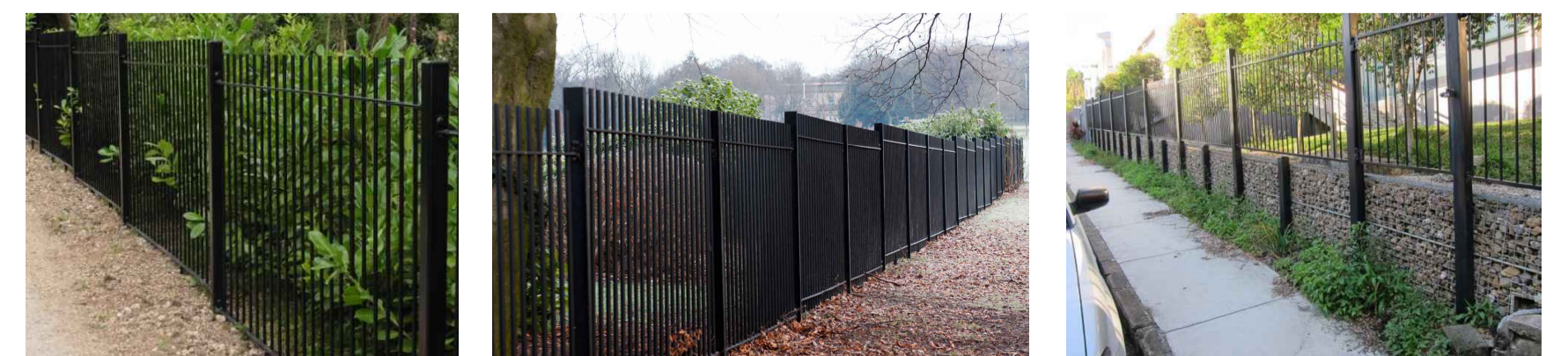
A 1.2m high galvanised steel fence B 2.0m high galvanised steel fence C Galvanised steel fence on gabion wall (overall height 2.0m)