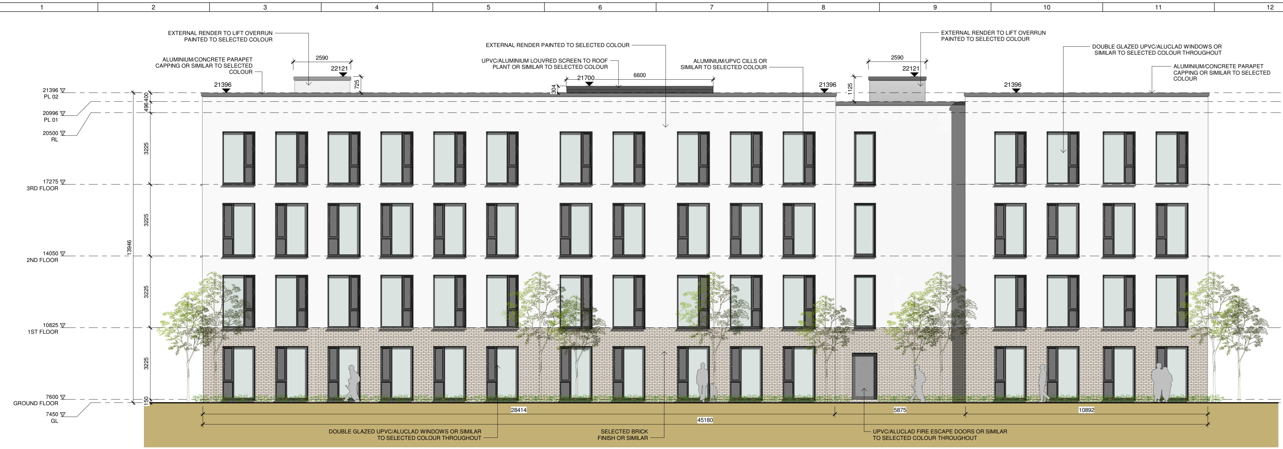
1 FRONT (SOUTH) ELEVATION