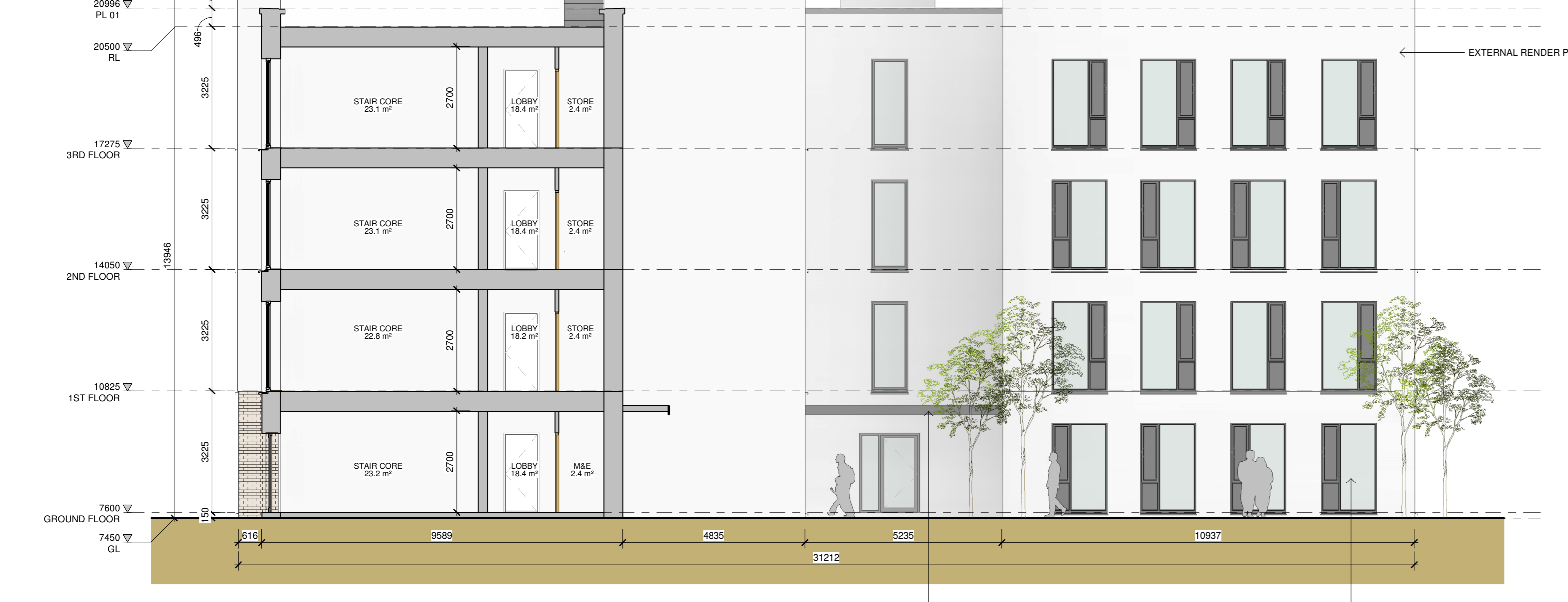
C SECTION C-C