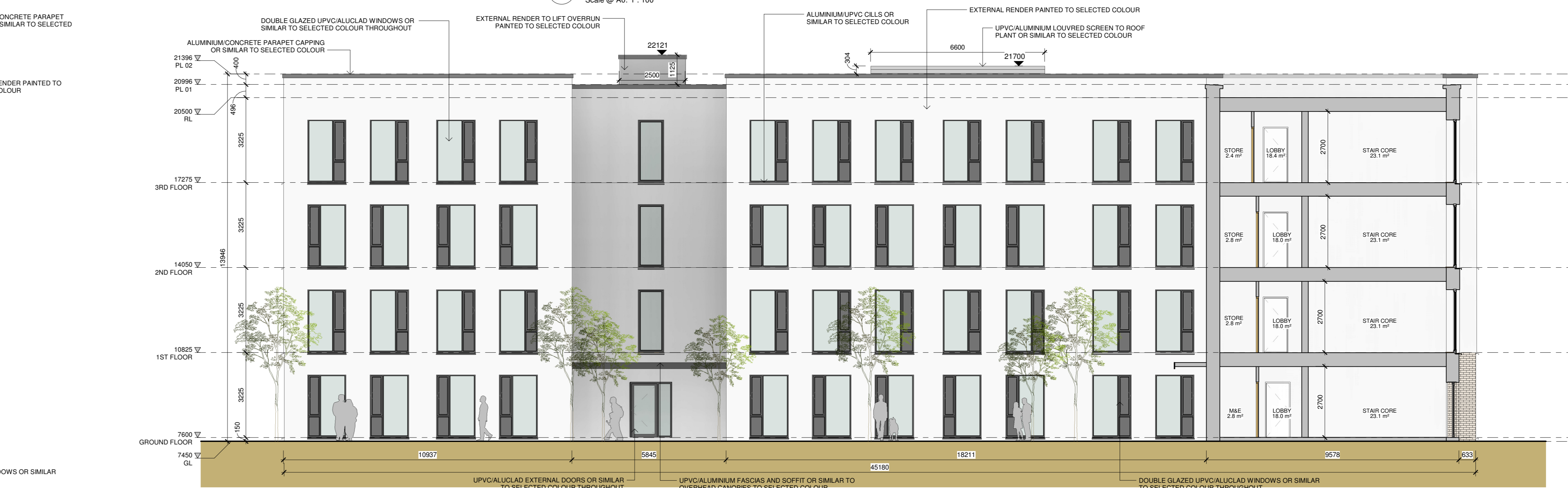
B SECTION B-B