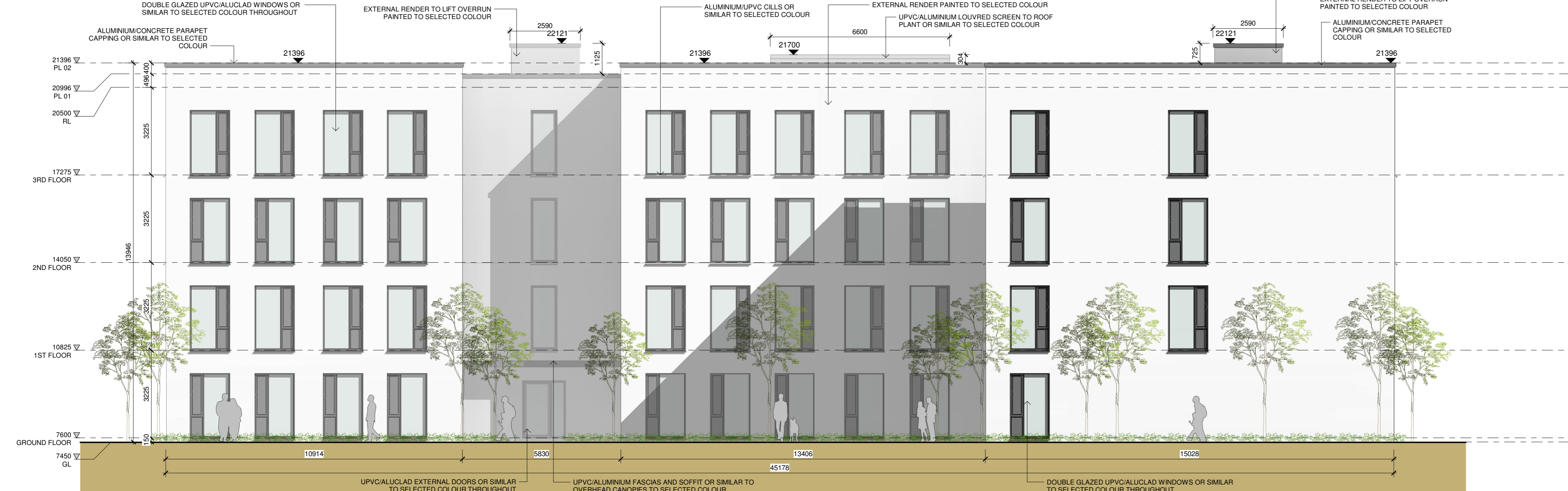
3 REAR (NORTH) ELEVATION