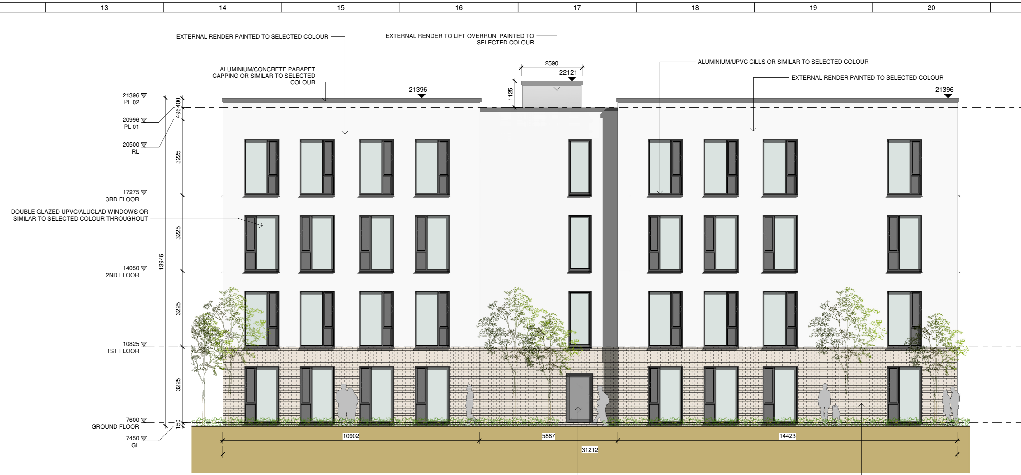
2 SIDE (WEST) ELEVATION