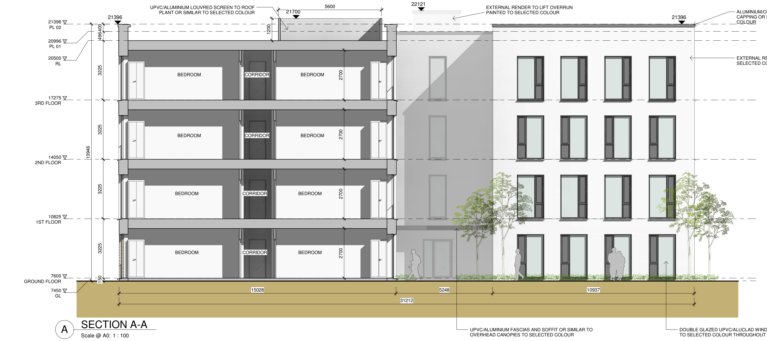
A SECTION A-A