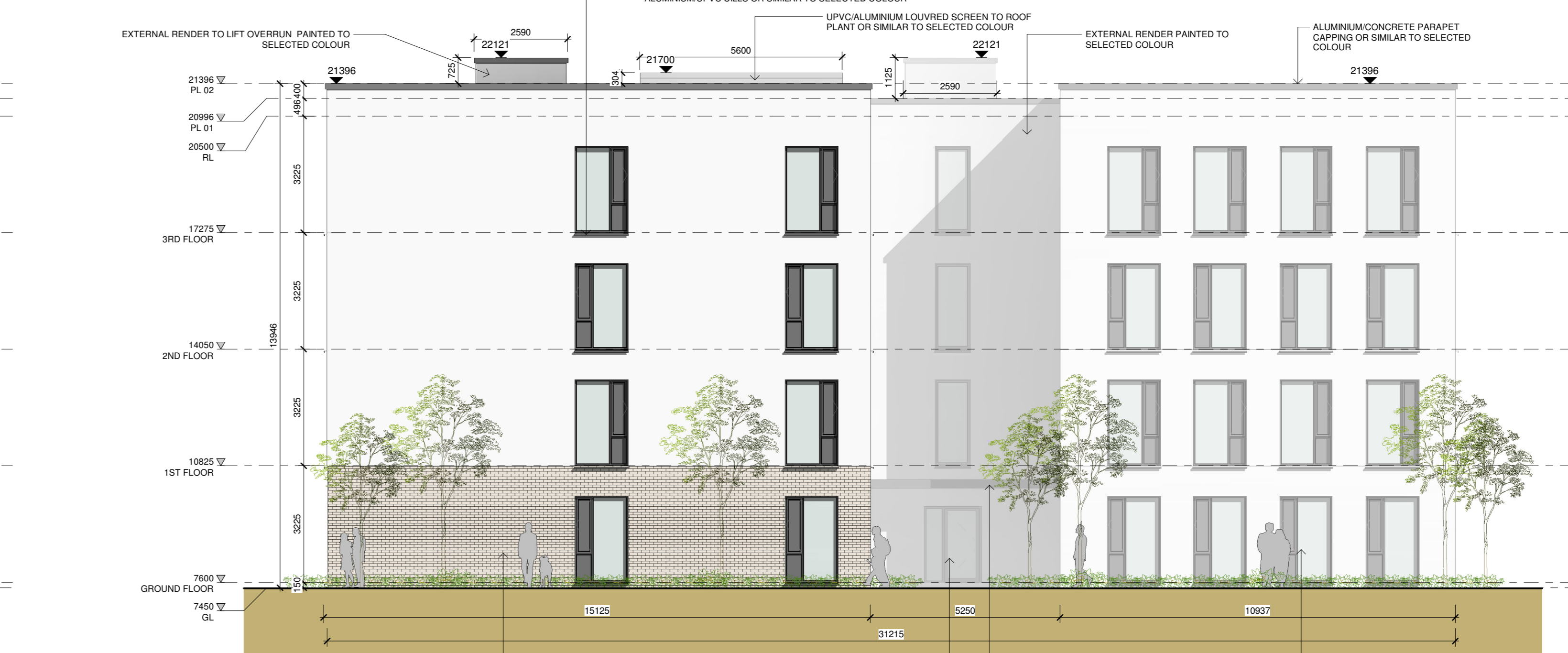
4 SIDE (EAST) ELEVATION