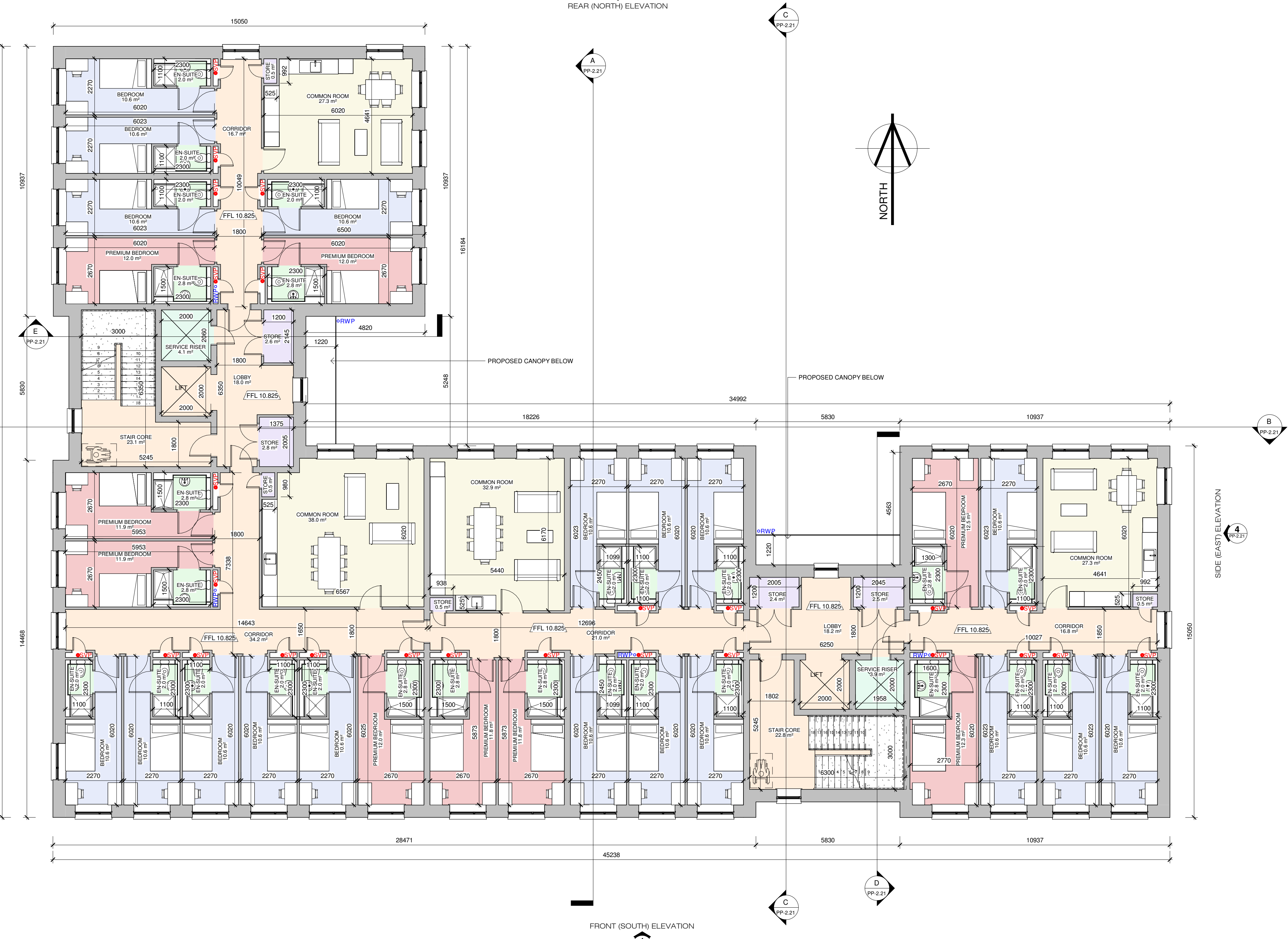
2 1ST FLOOR Scale @ A0: 1:100

IMPORTANT NOTE: Work to signed dimensions only - do not scale print. All setting out dimensions to be checked and confirmed on site prior to commencement of work. Any discrepancies should be brought to the attention of the architect. If in doubt - ask! All construction methods, materials, services and regulations to be in accordance with all Irish Building Regulations and codes of practice at the time of construction. All sub-contractors are ultimately responsible for ensuring compliance with the regulations within their own trade. This drawing is copyright to Fewer Harrington & Partners.