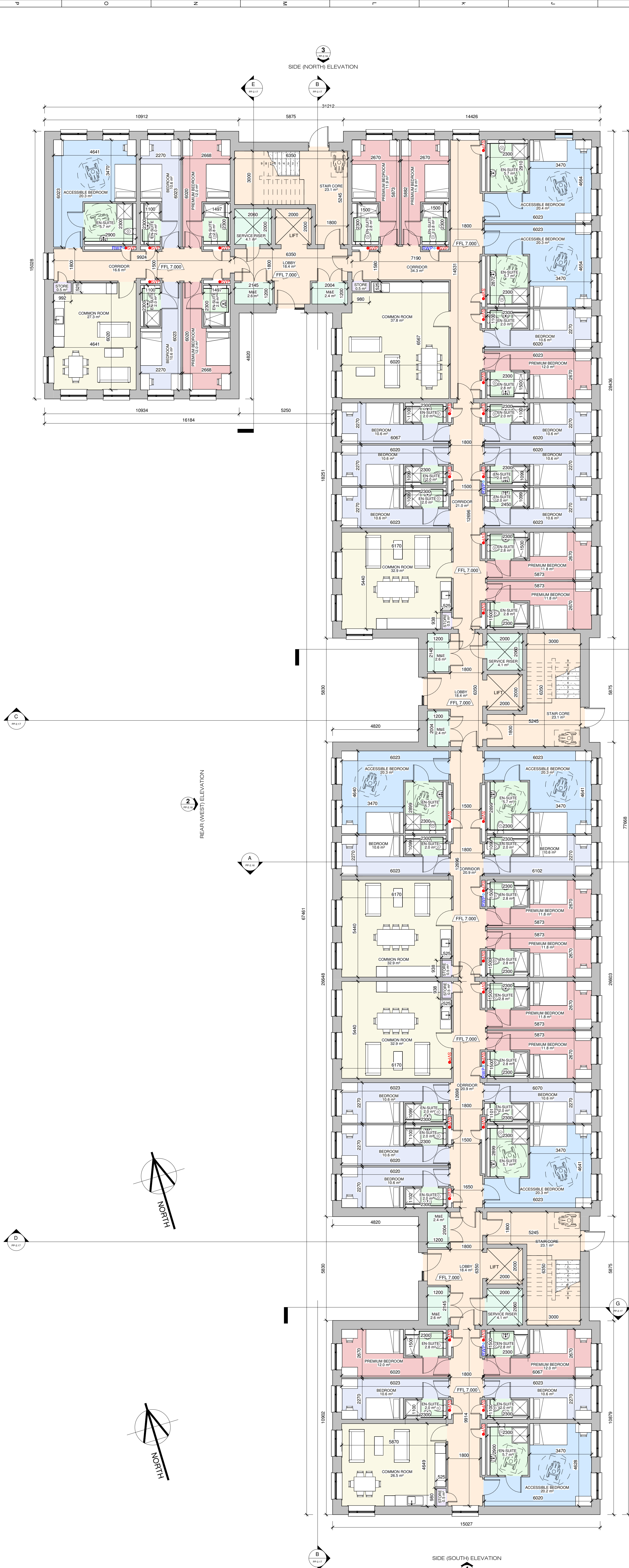
1 GROUND FLOOR Scale @ A0: 1 : 100