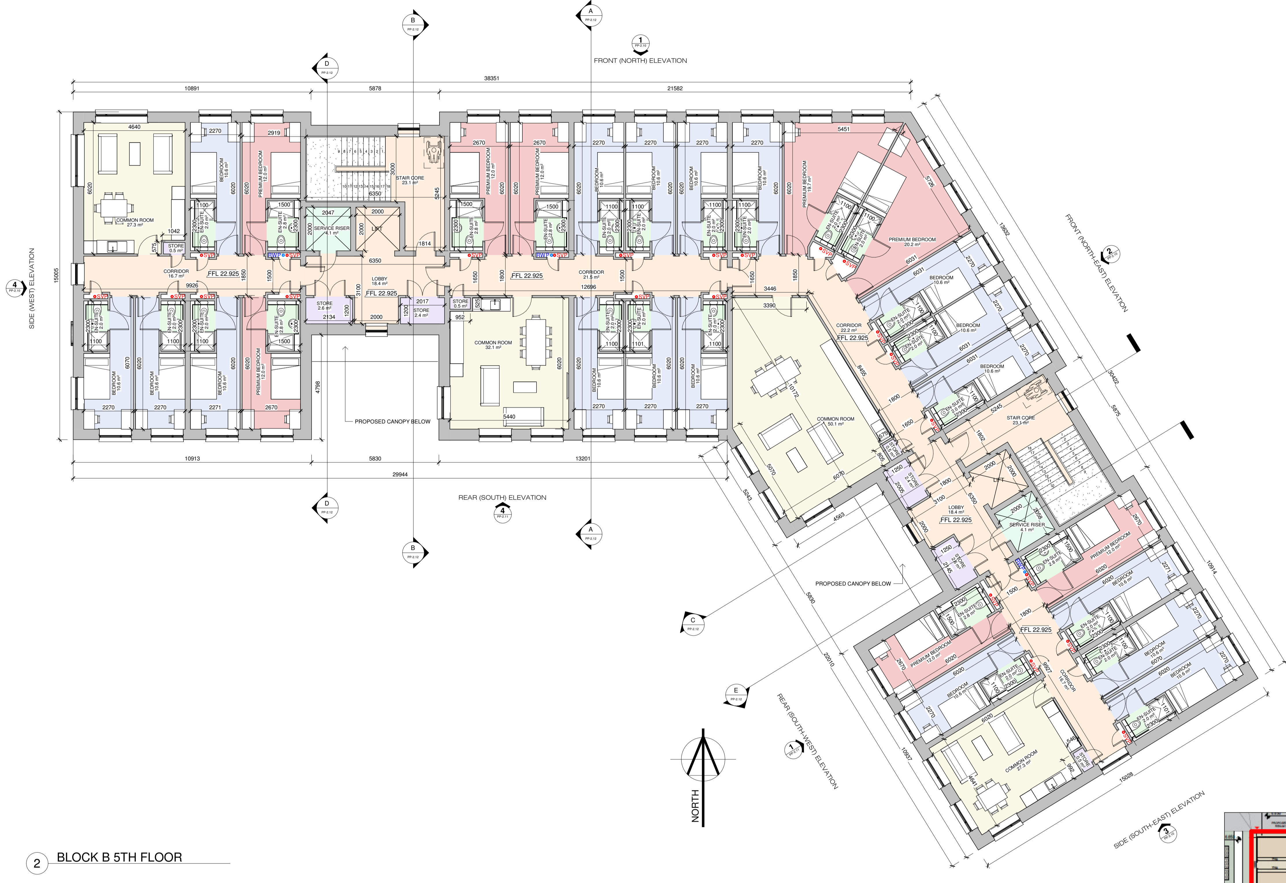
2 BLOCK B 5TH FLOOR