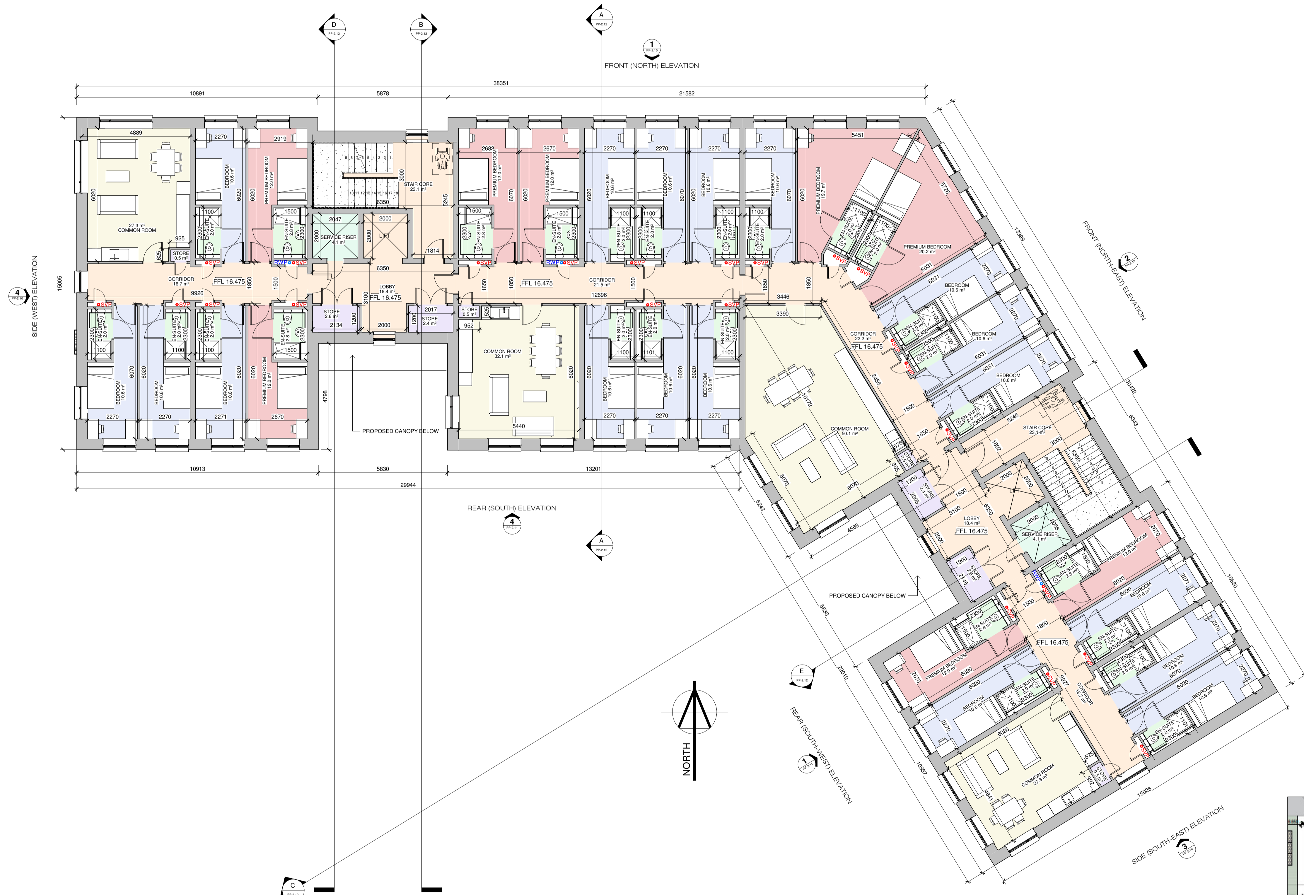
2 BLOCK B 3RD FLOOR