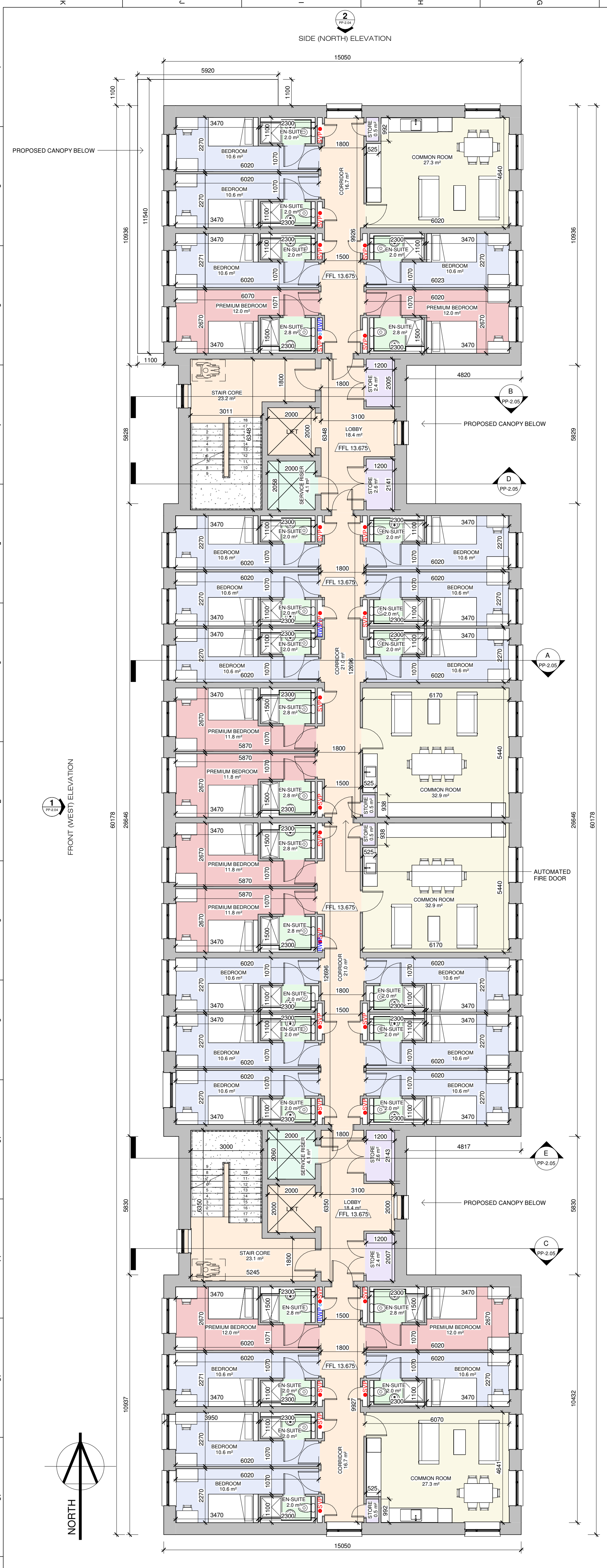
1 BLOCK A 2ND FLOOR Scale @ A1: 1:100