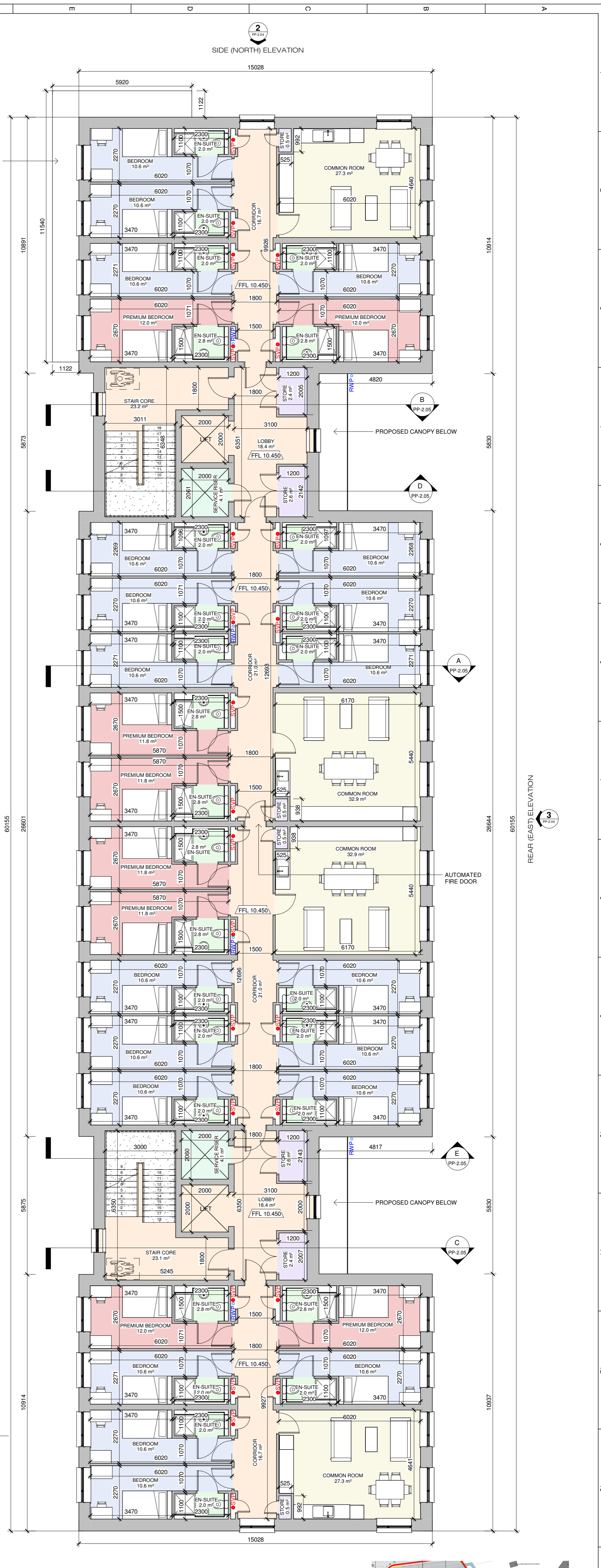
2 BLOCK A 1ST FLOOR Scale @ A1: 1:100